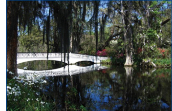
Take in the Picturesque Views of Charleston

Day 9: Enjoy a Continental Breakfast before departing for home... a perfect time to chat with your friends about all the fun things you've done, the great sights you've seen and where your next group trip will take you!