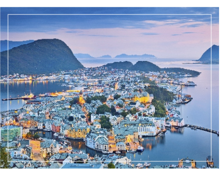
starting at $5,429/person

(based on double occupancy in an Inside stateroom)